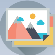
IMAGE QUALITY Images should be at least 300dpi and using the correct color profile. Additionally, all images need to be linked or embedded.